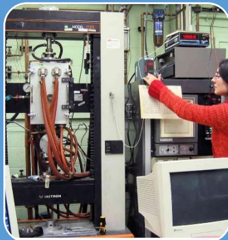
Argonne's tribology lab.