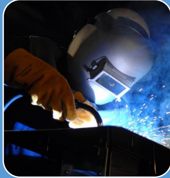
Welding, Creative Commons