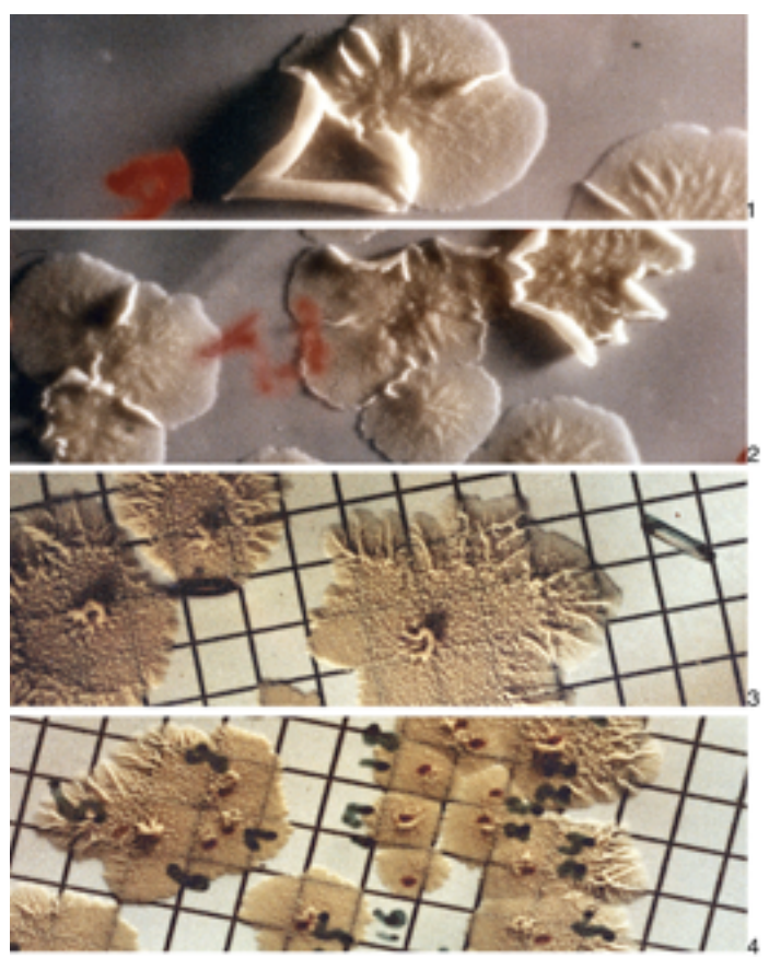
Pictures 1 and 2 : Samples of Bacillus Subtillus grown during the first performance of Robert Staehle's experiment (ED-31) aboard Skylab. Pictures 3 and 4: Colonies of the same bacteria that developed during the second performance of the experiment. The experiment determines the effect of the Skylab environment on survival, growth rates, and mutations of certain bacteria and spores. (<u>http://images.nasa.gov/</u> <u>details-0102077</u>)

Second, remember that spores are everywhere, and they are tough! Viable spores have been reported