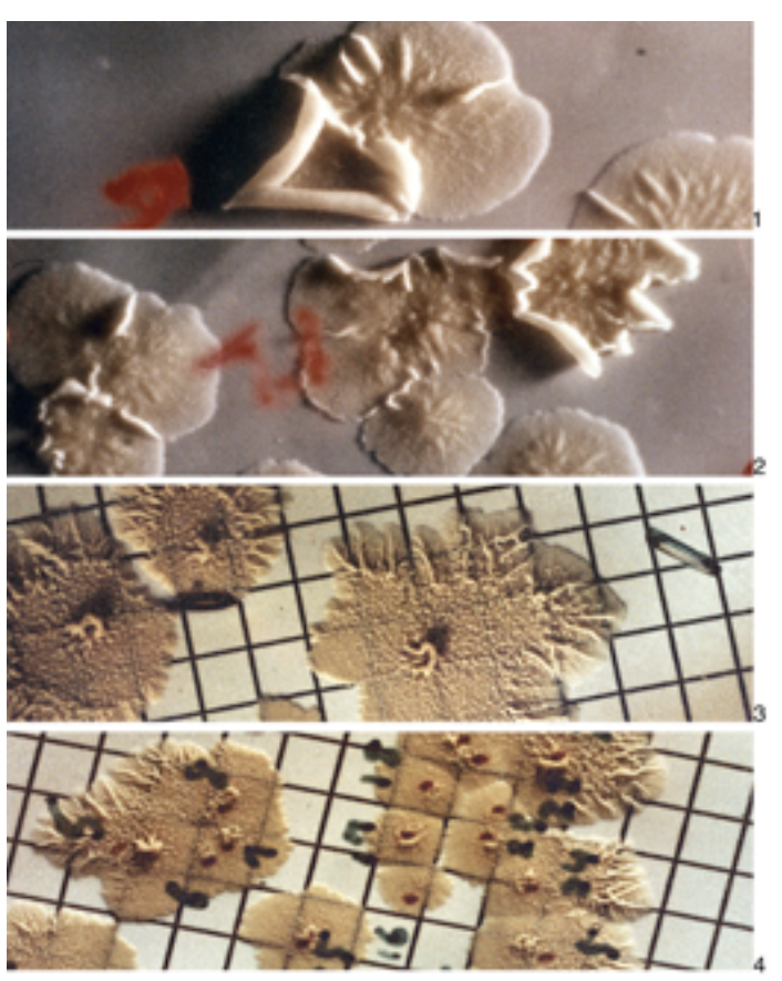
Pictures 1 and 2: Samples of Bacillus Subtillus grown during the first performance of Robert Staehle's experiment (ED-31) aboard Skylab. Pictures 3 and 4: Colonies of the same bacteria that developed during the second performance of the experiment. The experiment determines the effect of the Skylab environment on survival, growth rates, and mutations of certain bacteria and spores. (http://images.nasa.gov/details-0102077)

Second, remember that spores are everywhere, and they are tough! Viable spores have been reported