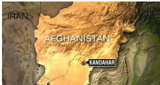
Figure 2: Nimrod XV230 crashed near Kandahar, Afghanistan.