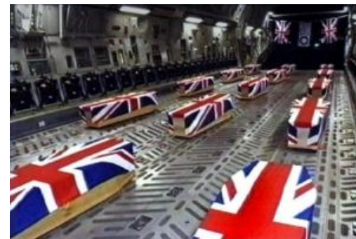
Figure 3: Fourteen servicemen perished in the crash.