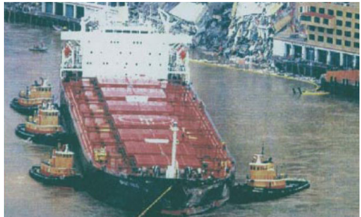
Figure 1: 'Allision' is the nautical term used when a moving vessel strikes a stationary object. Here, tugboats guide the MV Bright Field away from the allision site in New Orleans.

The Bright Field drew propulsion power from one five-cylinder, two-stroke, turbocharged diesel engine. The engine could be started, stopped, reversed, accelerated, and decelerated from either the bridge or the engine room. Increasing the vessel's speed (and thereby increasing engine rpm) too quickly could damage the engine, so a scavenging air pressure limiter restricted the engine's acceleration rate. During emergencies requiring a rapid increase in rpm, bridge officers could override the limiter by ordering personnel in the engine room to activate a "crash maneuver" button.