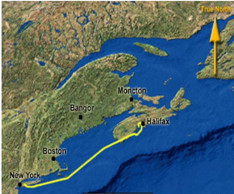
Actual SR 111 flight path