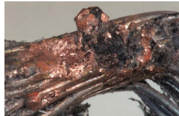
Recovered IFEN Cable segment with area of melted copper, indicating an arcing event occurred