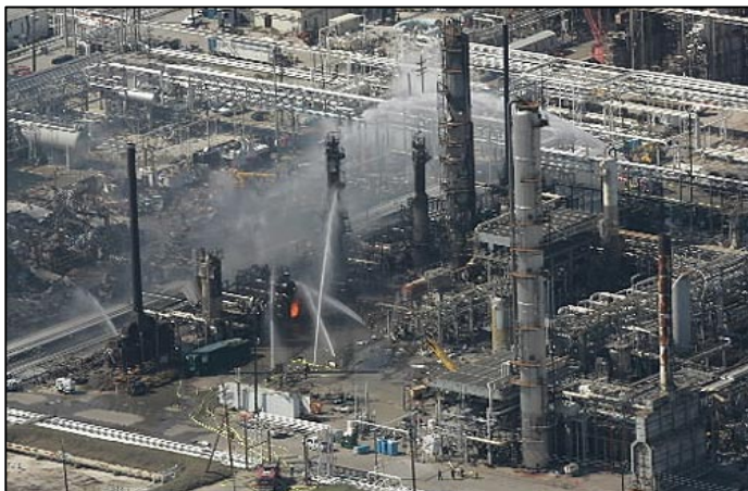
View of damaged equipment post accident.

The independent Baker Commission was empanelled to investigate BP North America’s oversight effectiveness of safety management systems at its refineries. The panel report cited BP for failing to identify and correct the safety problems, especially those related to mechanical integrity inspection and testing. Improvements in the process safety management culture were recommended along