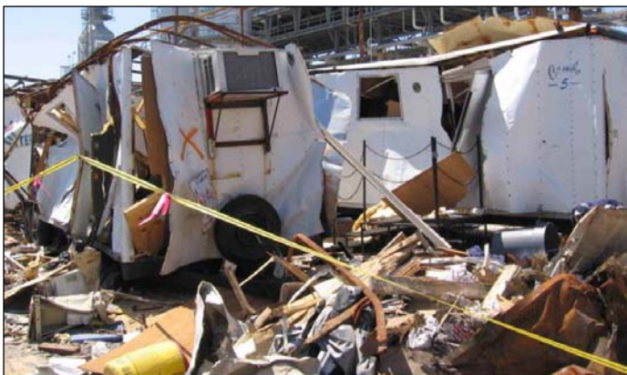
Remains of trailers after destruction.

Most of the fatalities occurred in or around trailers that were susceptible to blast damage and were located within 150 feet of the blowdown drum and vent stack. These trailers were placed in close proximity to the distillation unit in violation of facility sitting policy. This unit had experienced hydrocarbon releases, fires, and other process safety incidents over the past two decades. There was no blast wall or sufficient separation to protect the trailers from an explosion, deflagration, or detonation event.