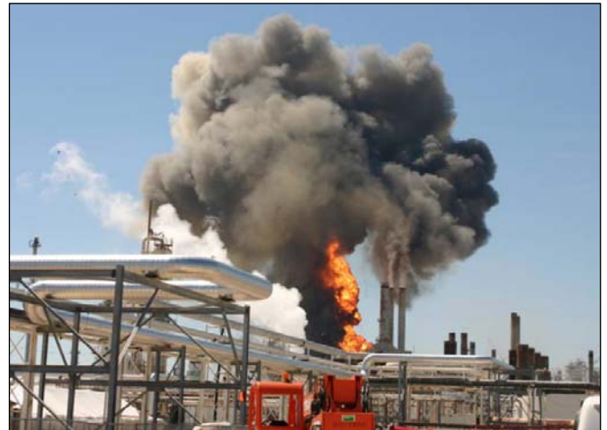
Blowdown stack emitting flames after explosion.

On the morning of March 23, 2005, the 164 foot tall distillation tower at the BP Texas City Refinery was res-