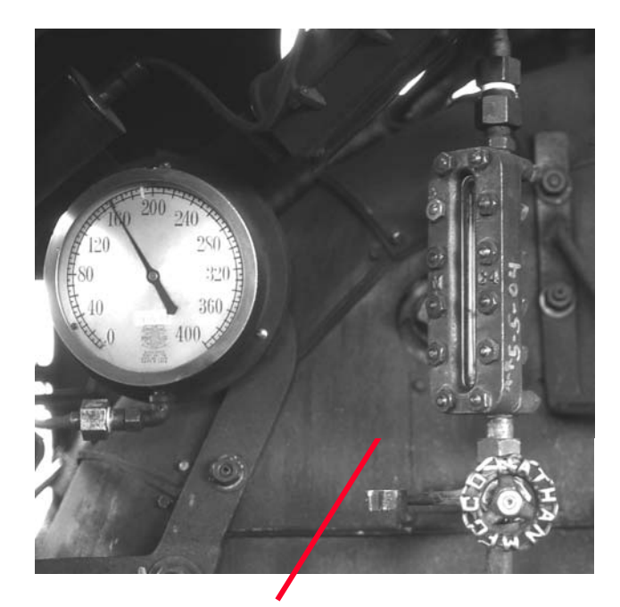
Typical Water Glass