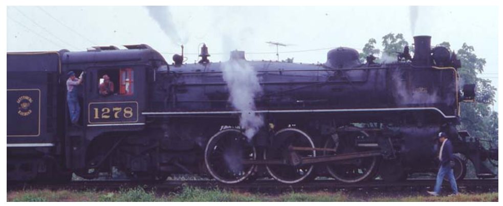
Gettysburg 1278 @ Gettysburg Oct 1988