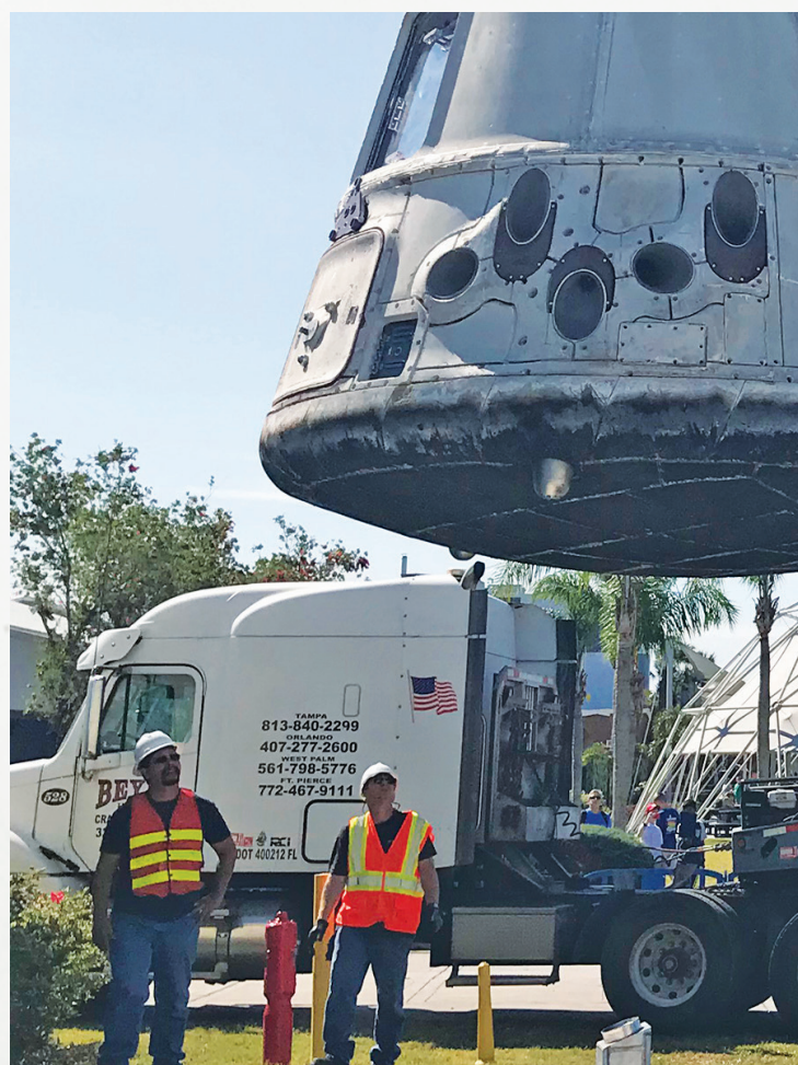
Kennedy Space Center: The SpaceX crew worked alongside Kennedy Space Center employees to return the Dragon capsule to the visitor complex.