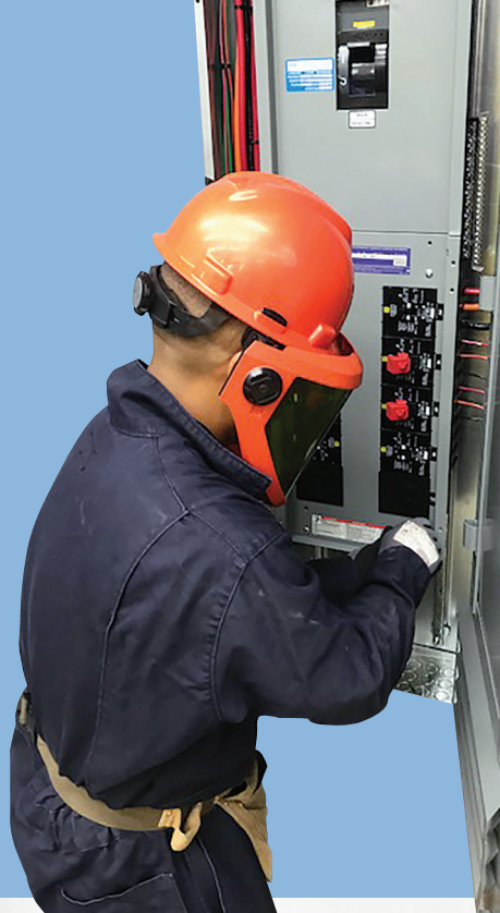
Jet Propulsion Laboratory: An electrician wore proper Personal Protective Equipment — arc flash coverall, face shield and leather gloves — while working on a circuit breaker.